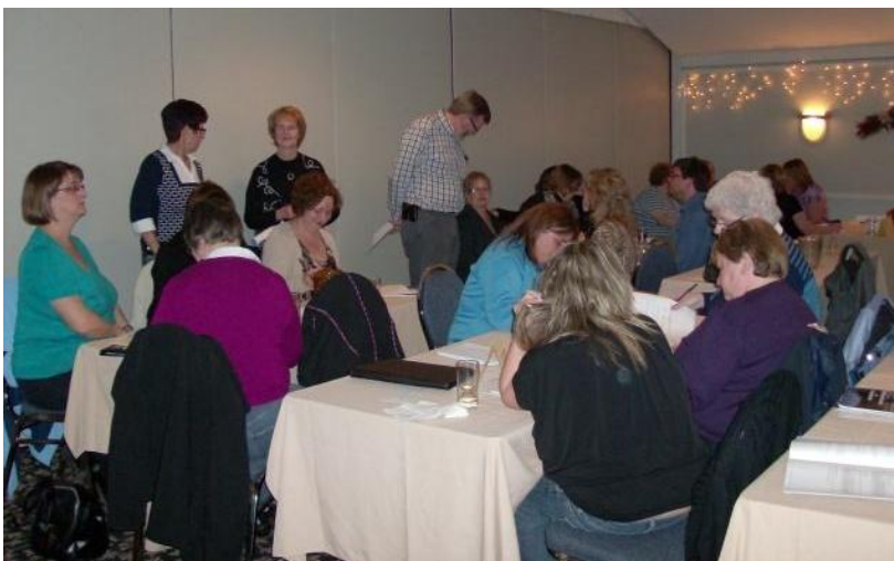
Corner Brook training session