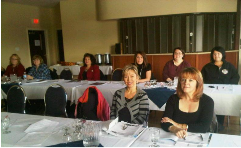
Bay Robert’s training session